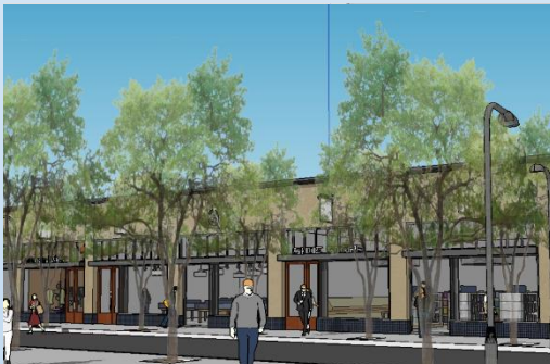
110' of frontage