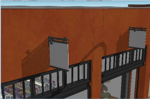
Your sign here!